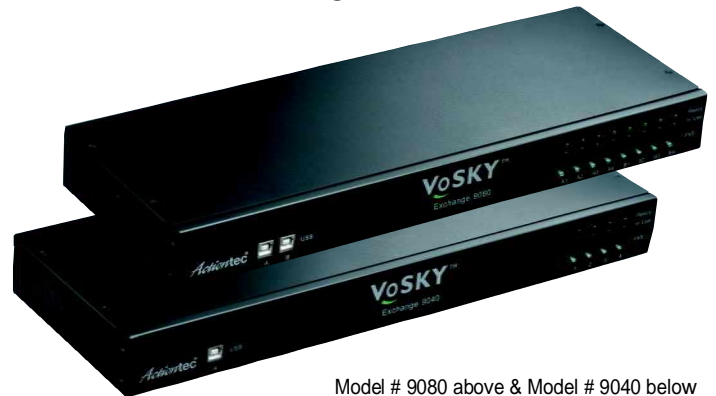
Model # 9080 above & Model # 9040 below

A ctiontec Electronics breaks through another technological